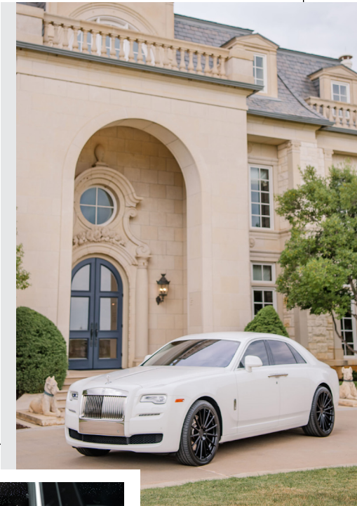
Adam from CoHost Luxury Collection

meet our inclusive & renowned team of vendors who are acclaimed in their respective services with over 40+ years combined industry experience